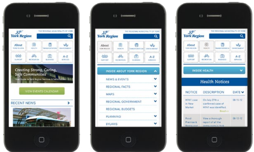
Mobile Website example

LONDON ScreenWorks, Studio 2.15 22 Highbury Grove London, UK N5 2EF T: +44 (0)20 3598 2601